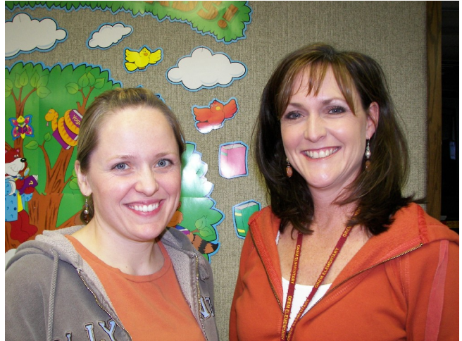
New Council Members